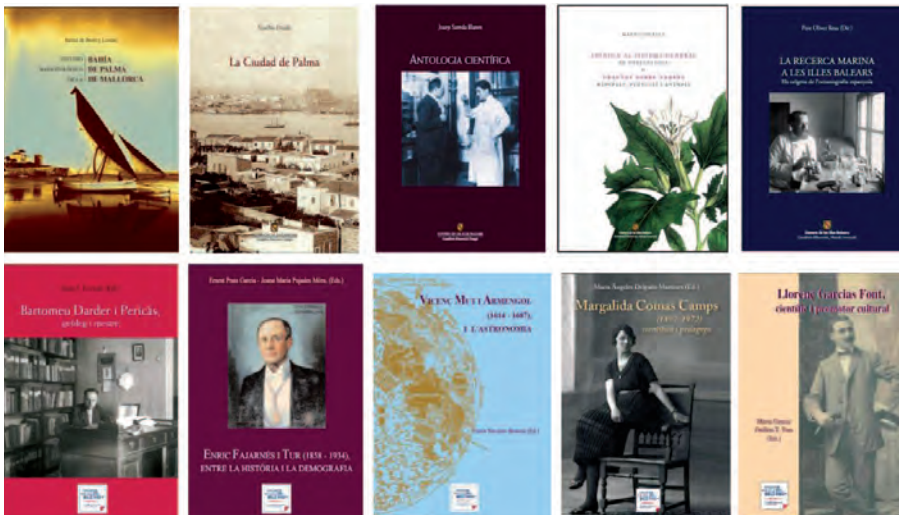
Fig. 3. Titles from the collection La ciència a les Illes Balears . The aim of this collection is to make available facsimile editions of representative works of the scientific production carried out in the Balearic Islands throughout history.

Government of the Balearic Islands—the institution responsible for the survival of the collection. He is a magnificent example of the fact that science has been done on the Islands for centuries, evidencing the preservation of our language not only through its literature or in the service of tourism.