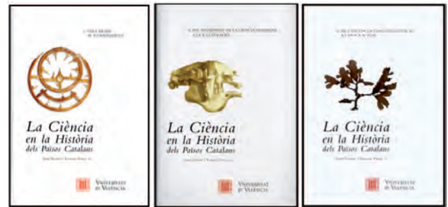
Fig. 1. The three volumes of La Ciència en la Història dels Països Catalans are the work of more than 50 historians linked in one way or another to the SCHCT (Fig. 1).

The idea of launching the collection La Ciència a les Illes Balears ( Science on the Balearic Islands ) was motivated by an awareness of the scarce knowledge that existed regarding the